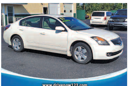
2007 NISSAN ALTIMA Fuel Efficient, Mid size Sedan ONLY $199*/MONTH