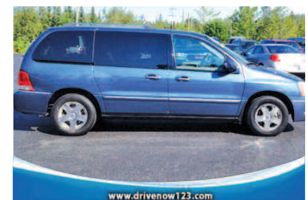
2006 FORD FREESTAR LIMITED All the bells and whistles ONLY $200 DOWN