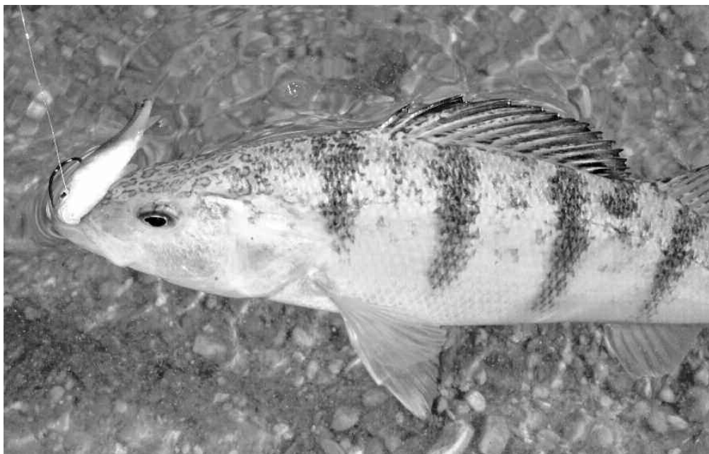
Undoubtedly, the best bait for perch are small minnows as illustrated by this Crooked Lake yellow-belly.

Young's Bait and Party Store in Alanson (231-548-5286) perch fishing can be excellent on Burt. Another water body that we've done very well on is Higgins Lake in Roscommon County. During summer months schools of perch on Higgins will be located near the Sunken Island or along the drop-off in 30-50 feet of water.