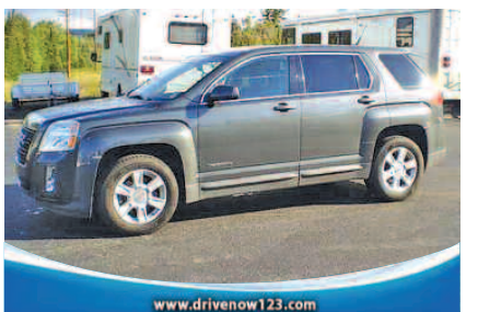
2010 GMC TERRAIN AWD Well Equipped and Ready for Winter ONLY $239*/MONTH