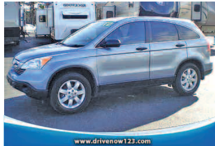
2007 HONDA CRV Low miles, Reduced $1000.00 NOW ONLY $11,795*