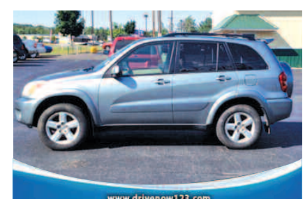
2005 TOYOTA RAV4 AWD Gas Saver, You can't go wrong ONLY $500 DOWN