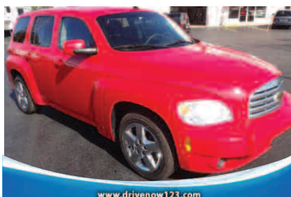
2009 CHEVROLET HHR LT1 Great Utility Vehicle ONLY $149*/MONTH