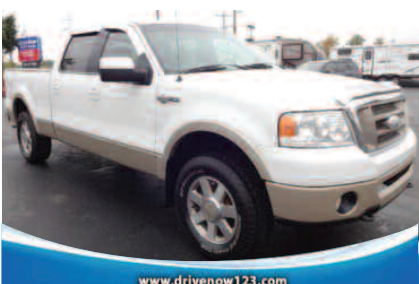
2007 FORD KING RANCH F150 Top of the Line 4X4 ONLY $399*/MONTH