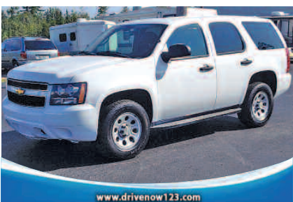
2010 CHEVY TAHOE 4WD $4000 below NADA NOW ONLY $17,495*