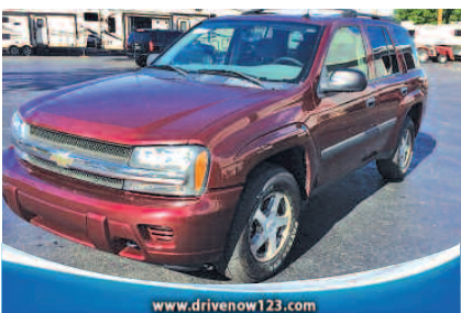
2003 CHEVY TRAILBLAZER 4WD A Northern Michigan Favorite ONLY $179*/MONTH