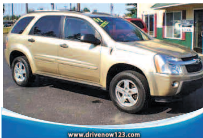
2005 CHEVROLET EQUINOX LS AWD No Excuses, Like New ONLY $199*/MONTH