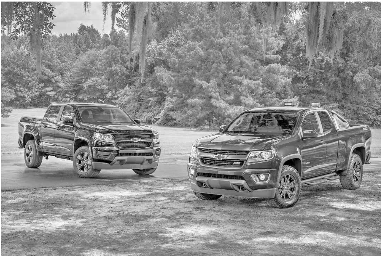
(L to R) 2016 Chevrolet Colorado Midnight Edition and Trail Boss.