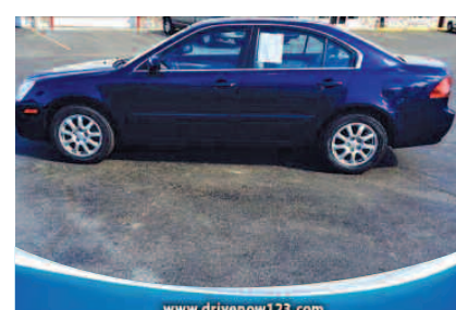
2006 KIA OPTIMA LX Kia, Great fuel economy, room for five ONLY $200 DOWN