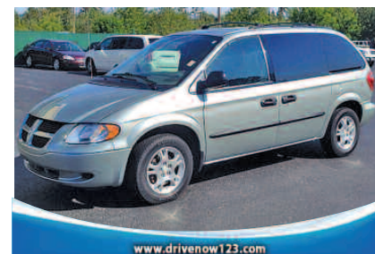
2006 DODGE CARAVAN SE Great value! ONLY $200 DOWN