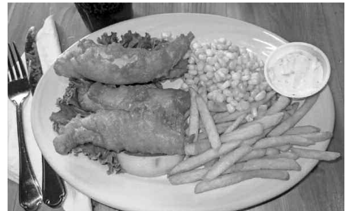
Many diners rank lake perch as their favorite fish table-fare. Grayling's Dead Bear Brew Pub serves a nice portion with multiple side dish choices.

When it comes to what these banded bandits will bite on the three best baits are small minnows, small minnows, and small minnows. Indeed, feeding studies have shown that the vast majority of an adult perch's diet consists of smaller fish. Therefore, if you are targeting them it helps immensely to have a bucket full of lively "perch minnows." These are often immature versions of the "blue" minnows anglers use for walleye and pike. If you have the gear and time,