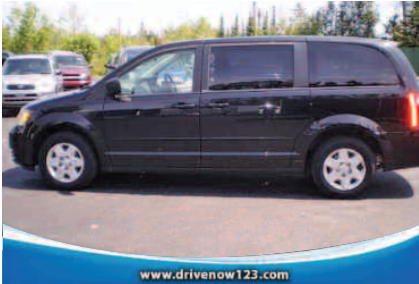
2009 DODGE GRAND CARAVAN SE Save $1500.00 NOW ONLY $8,495*