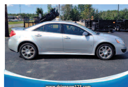
2009 PONTIAC G6 GT SEDAN Fun to drive V6 ONLY $500 DOWN