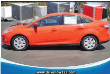
2012 FORD FOCUS SE SEDAN Air, Cruise, CD Changer ONLY $199*/MONTH