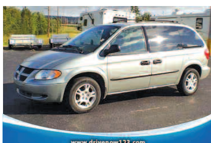
2003 DODGE CARAVAN Leather Trim, Rear Buckets ONLY $200* DOWN