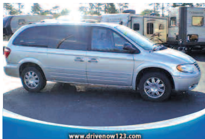
2006 CHRYSLER TOWN AND COUNTRY Leather Trim, Loaded ONLY $500* DOWN