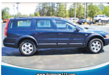
2001 VOLVO XC70 AWD Well Equipped, Won't Last Long NOW ONLY $4,795*