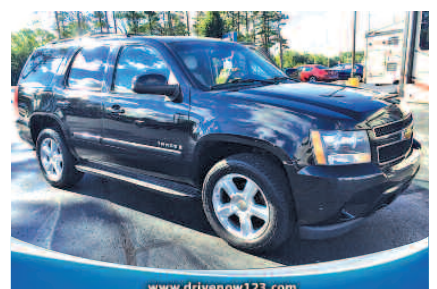
2006 CHEVY TAHOE LTZ 4WD 3 Rows of Seats, Loaded NOW ONLY $13,995*