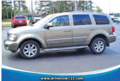
2007 CHRYSLER ASPEN LIMITED AWD Save $1500.00 NOW ONLY $11,795*