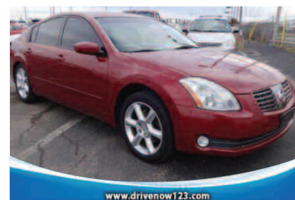
2005 NISSAN MAXIMA Must see nicely equipped ONLY $200 DOWN