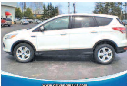
2013 FORD ESCAPE AWD Like New, Top selling Compact SUV ONLY $262*/MONTH