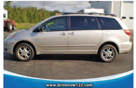
2005 TOYOTA SIENNA AWD Save $2500.00 NOW ONLY $3,995*