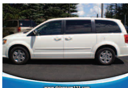
2011 DODGE GRAND CARAVAN EXPRESS Vacation Ready, with stow and go NOW ONLY $10,995*